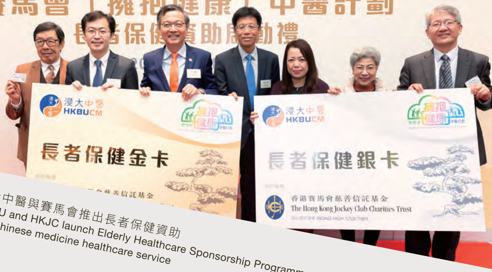
浸大中醫與賽馬會推出長者保健資助 HKBU and HKJC launch Elderly Healthcare Sponsorship Programme for Chinese medicine healthcare service