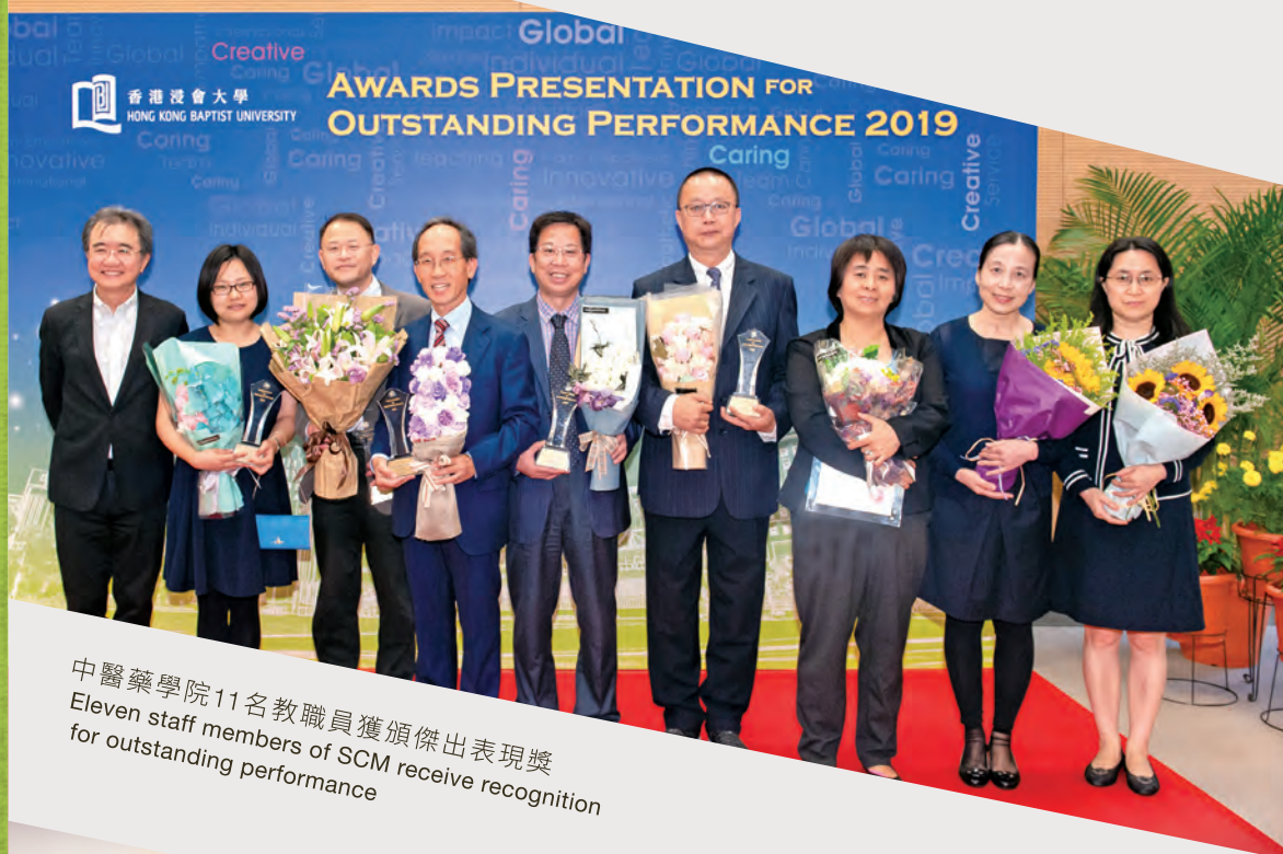
中醫藥學院11名教職員獲頒傑出表現獎 Eleven staff members of SCM receive recognition for outstanding performance